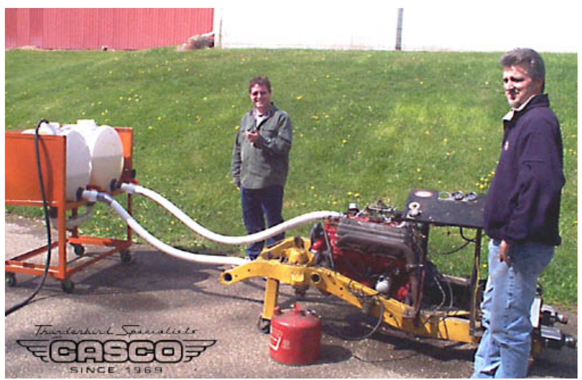
Our test assembly used two 30 gallon plastic tanks connected to an engine on our shop's engine test stand. The two plastic tanks were connected together with 2" pipe with a ball valve installed. One tank ran to the inlet of the water pump, and the other tank was connected to the water outlet on the engine. We filled both tanks with 15 gallons of water. Then we closed the ball valve that connects the two tanks and started the engine. While the engine was running it pulled water out of one tank and pumped into the other tank. We recorded the time it took to pump 10 gallons of water. It was surprising to see just how much water is being moved by the water pump that we have questioned for so long.

We started our investigation by asking some radiator manufacturers if more flow through the radiator was a good thing. They agreed that the more flow the better. When we asked if there was a point of diminishing returns one manufacturer said, "When you have so much water flowing into the radiator that it blows the top tank apart it's time to think about reducing the flow rate." So we set out to design our test apparatus with the goal to find the pump configuration that gave us the highest flow rate. In particular we were concerned about the flow rate at or near idle speed since this is the most common time to have overheating problems. In the case of parades, it's also the most embarrassing to have these problems.